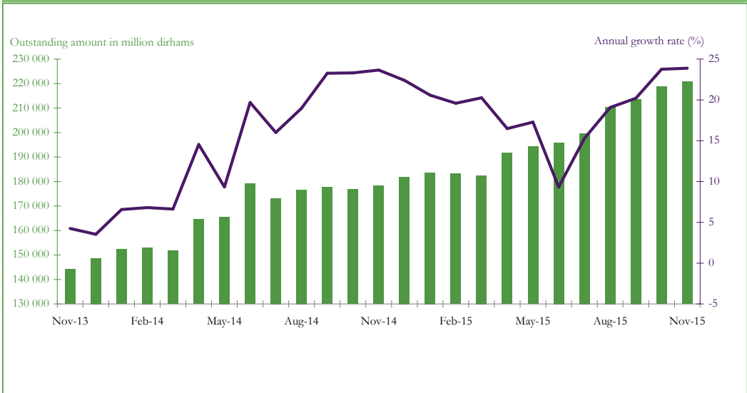
Chart 3: Change in Net international reserves